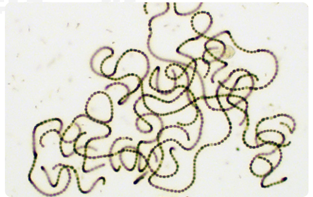
Here’s what the bloom sample looks like under a microscope! The top image shows Aphanizomenon . The bottom shows Anabaena . Both are forms of cyanobacteria.